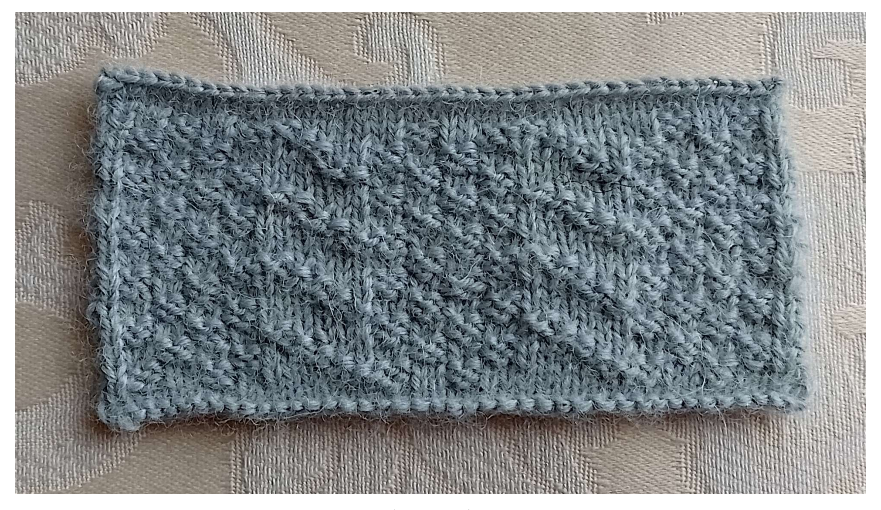
Swatch by Val Smith in West Yorkshire Spinners, Signature 4 ply 'Dusty Miller'

GP13 Version 1.4: 12.5.2023 Status: validated